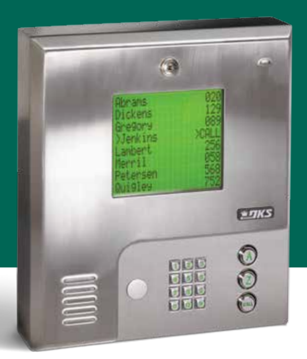
Wall Mount Shown