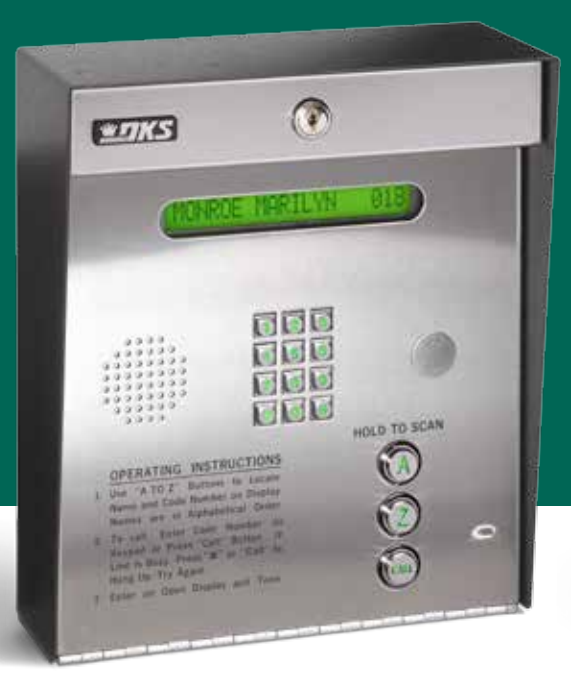
Surface Mount Shown