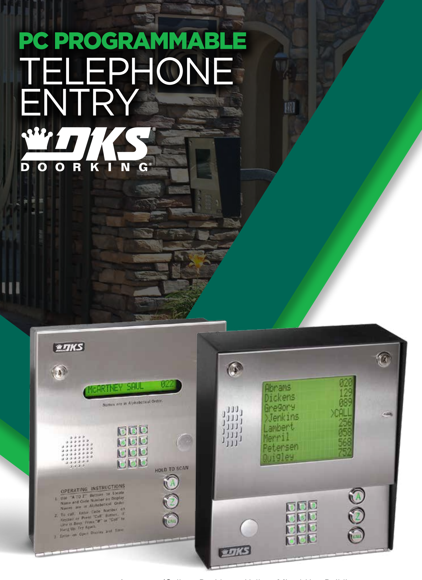
Apartment/College Residence Halls • Mixed Use Buildings Commercial/Industrial • Business/Home Multi Unit