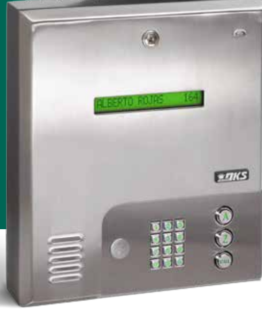
Flush Mount Shown