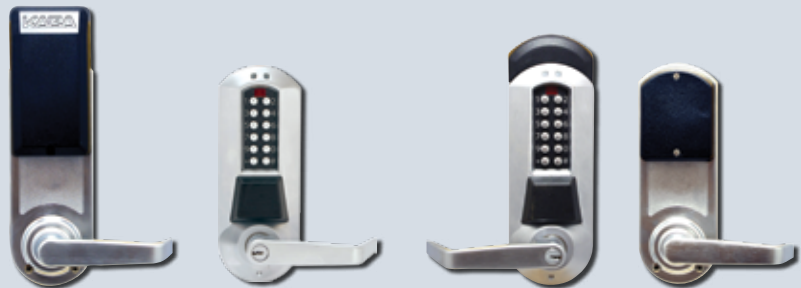
1. Inside Mount Option

For optimized operations, a ZigBee Gateway is powered from the USB when only one Gateway is required, and Power Over Ethernet (PoE) supplies power when a configuration includes multiple Gateways and a network. A plug-in transformer can also power a ZigBee Gateway or Router (no PoE is available).