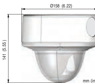
Surface-mount dimensions (with separately available VDA-455SMB-IP)