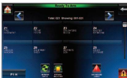
Zone List Screen