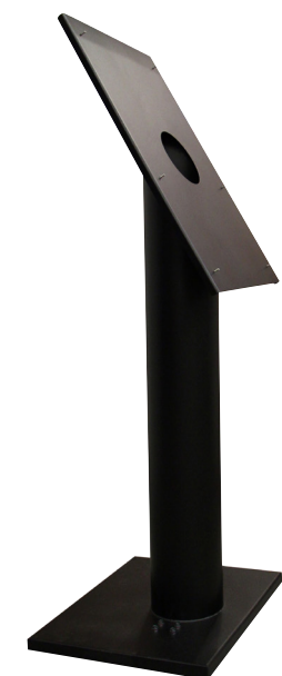
TX3-T-KIOSK Optional Black Pedestal