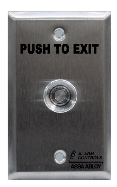
TS-16 Single Gang

Pneumatic time delay operator does not require power for timing function