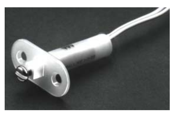
TS-20 3/8" Drill Mount