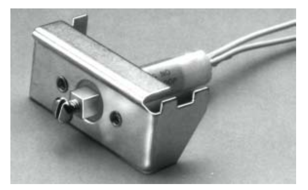
TSC-20 Clip Mounting