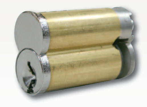
7 PIN POINTE SLIDING DOOR INTERCHANGEABLE CORE

Our precision engineering design, keying capability and availability make Arrow Pointe interchangeable cores our most specified brand for commercial, industrial and institutional applications.