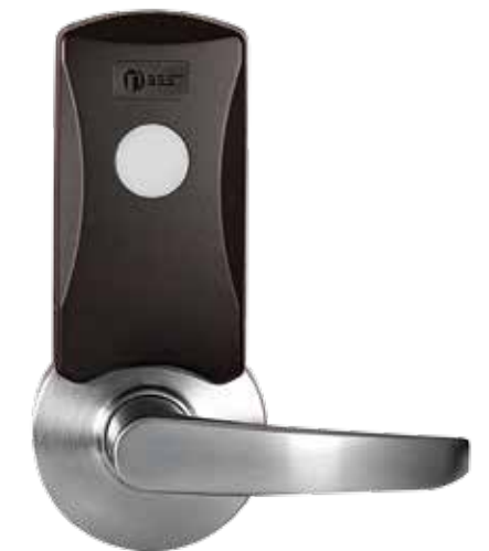
BEST SHELTER is a wireless responsive lockdown solution that can be configured to adapt to your building and security protocol.

SHELTER—a unique combination of code-compliant hardware and proven technology—is a responsive lockdown solution specifically designed for K-12 environments and their limited budgets. Even more, SHELTER was developed with input from those who have experienced live lockdown situations. This distinct perspective led to an innovative set of features and functionality that allows schools to custom tailor how SHELTER responds in the event of a lockdown.