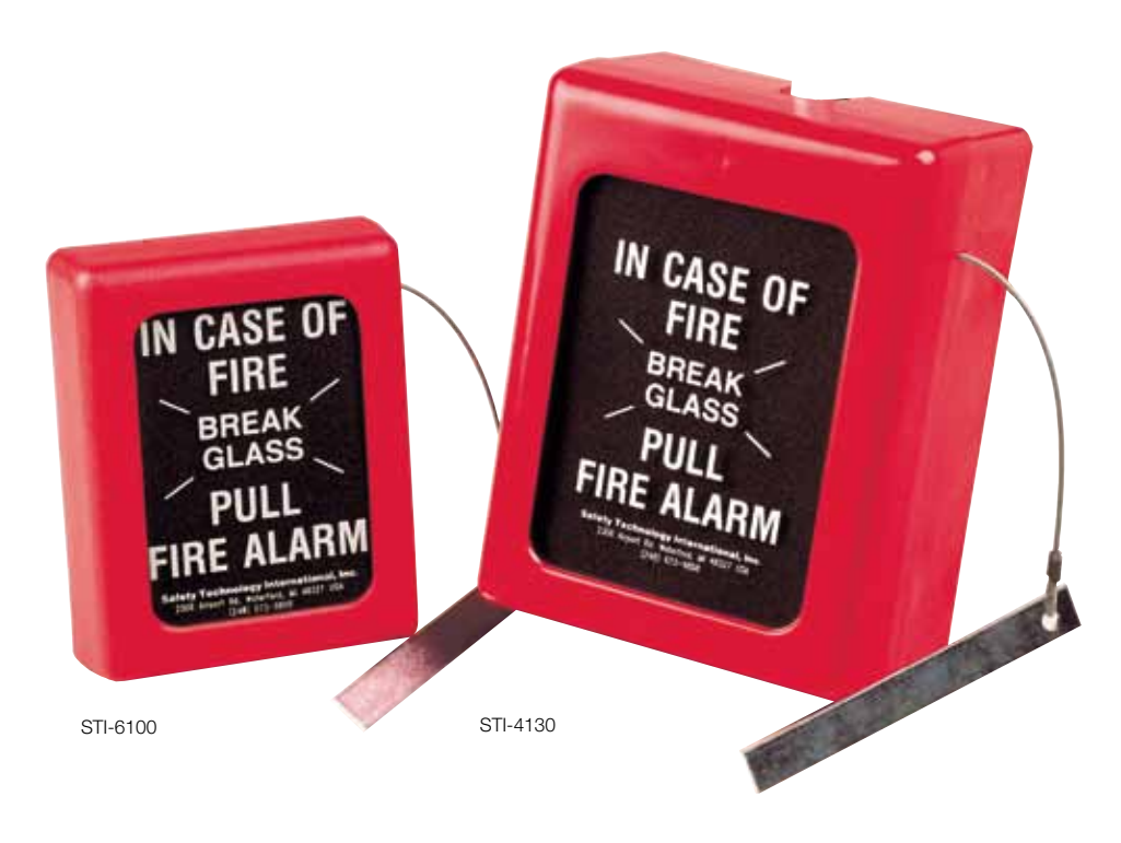
NOTE: Glass is clear — only appears dark for photo purposes.