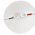
Smoke and Heat Detector (MCT-427/ SMD-427 PG2)