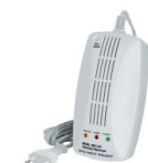
(MCT-441 / GSD-441 PG2)