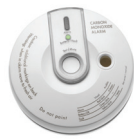
(MCT-442 / GSD-442 PG2)