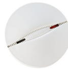
Smoke Detector (MCT-426/ SMD-426 PG2)