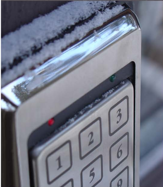
SKE-34S (Stainless Steel Bezel) shown

With 500 User Codes and 3 Programmable Outputs, the new SKE 12 Pad Series provides cost effective, self contained Keypad access control for residential, commercial and industrial applications. Solid state, Piezoelectric Switch Technology ensures superior performance in even the most extreme environment (heat, rain, snow or ice - up to 3/8"). Professional Grade Access Control designed and assembled in the USA and backed by a Limited Lifetime Warranty.