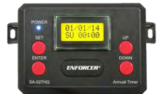
SA-027HQ 365-Day Annual Timer