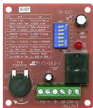
SA-025Q Multi-Purpose Programmable Timer