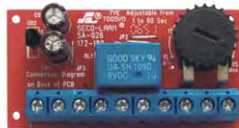
SA-026Q Miniature Timer Module