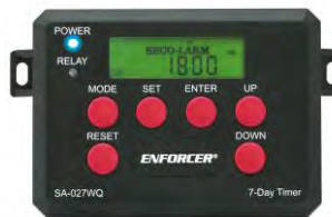
SA-027WQ 7-Day Timer