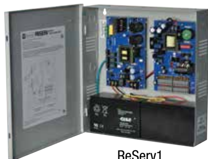
ReServ1 (order batteries separately)