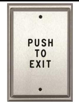
SINGLE GANG PLATE CLEAR FINISH BLACK FILL