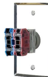
REAR VIEW OF SWITCH

SURFACE MOUNT BOX W/ TAMPER SWITCHES (MODEL SMB-1) WALLPLATE RETAINER (MODEL WPR) TIMER TO EXTEND CONTACT "ON" TIME (MODEL MT-1) HINGED COVER WITH HASP (MODEL HC)