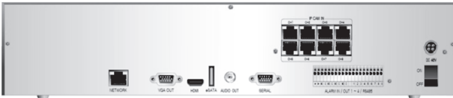
NVR8P Rear Panel View