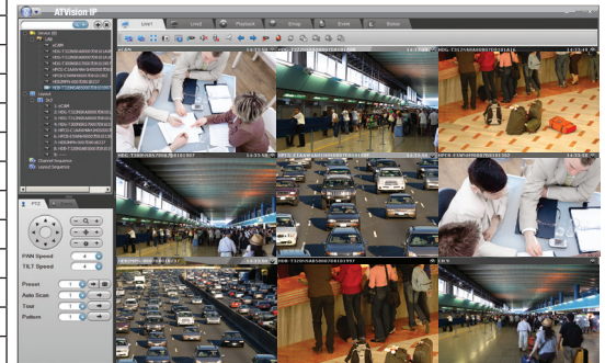
ATVision IP Remote Management Software