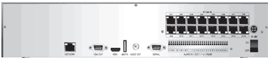
NVR16P Rear Panel View