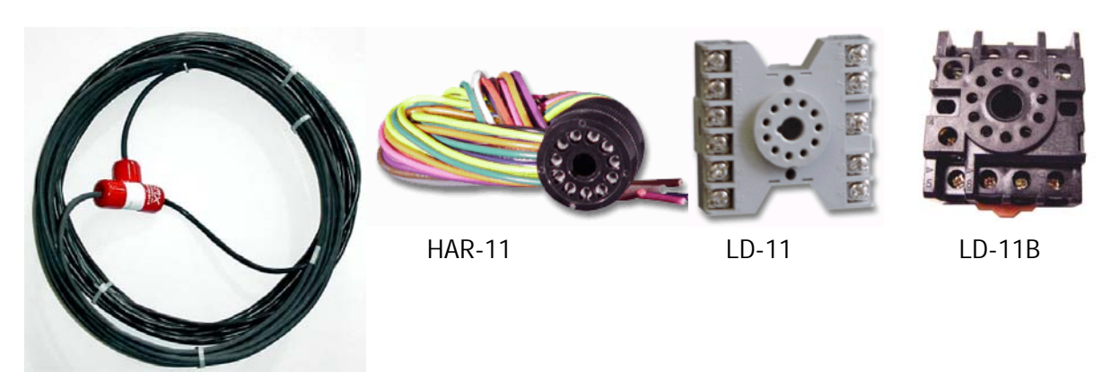
PR-XX with lightning protection built in

HAR-11 11 wire harness with 3 ft. of wire LD-11 11 pin DIN rail socket (Gray) LD-11B 11 pin DIN rail socket (Black)