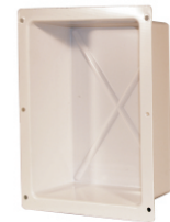
Plastic for flush mounting