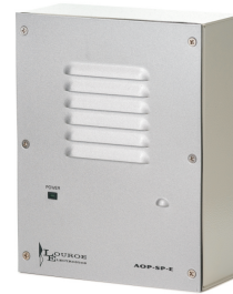
MODEL AOP-SP-E Speakerphone Wall Mount-Flush or Surface

Companion Model AOP-XD Transceiver Interface can be used for the above applications