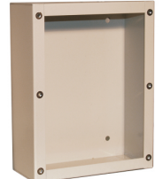
Metal for surface mounting