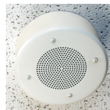
MODEL AOP-SP-CS 2-way Speakerphone Ceiling Mount-Surface