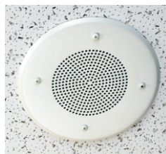
MODEL AOP-SP-CF 2-way Speakerphone Ceiling Mount-Flush