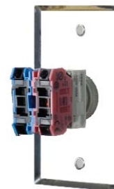
REAR VIEW OF SWITCH

SURFACE MOUNT BOX W/ TAMPER SWITCHES (MODEL SMB-1) WALLPLATE RETAINER (MODEL WPR) TIMER TO EXTEND CONTACT "ON" TIME (MODEL MT-1) HINGED COVER WITH HASP (MODEL HC)