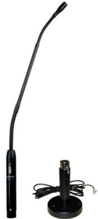
IW-MIC with the base