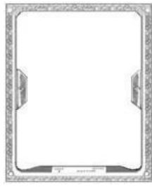
IH102 Flush Steel Mounting Ring