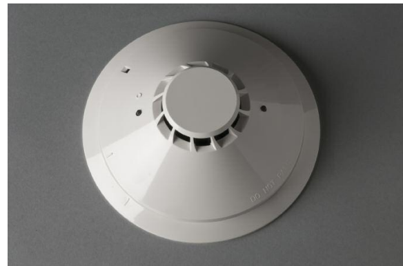
Model HFS-P and HFS-PT

Single Gang Box; Minimum Depth – 1½" (38 mm)