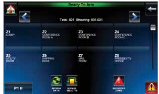
Zone List Screen