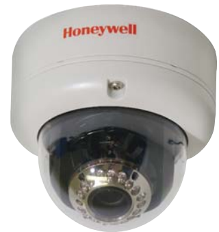
HD4DIRS shown with mounting ring for surface mount