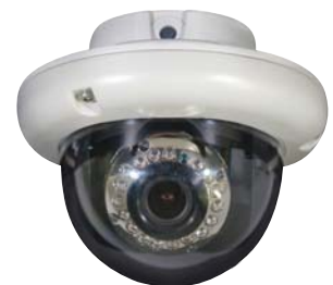
HD4DIRS shown without mounting ring for flush mount