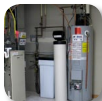
Utility / Basement