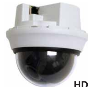
H3D2F shown with mounting ring for surface mount