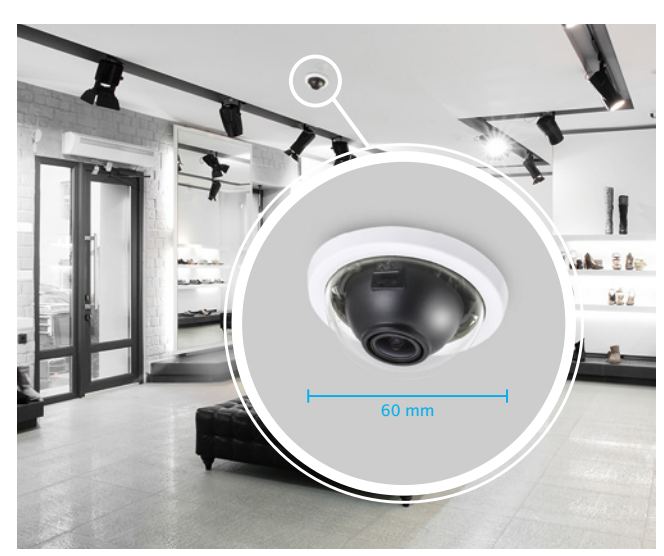
Ultra-mini Recessed-Mount Fixed Dome Network Camera