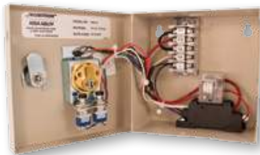
FAR shown with BPS and Fire Alarm