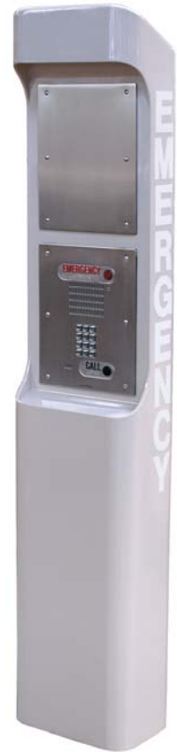
ETP-PMD shown with ETP-400K and 25141 blank stainless faceplate