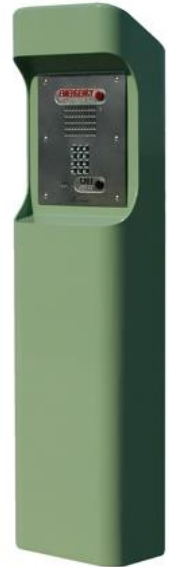
ETP-PM shown with ETP-400K