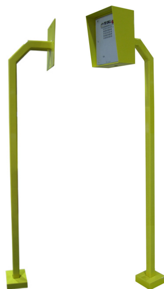
Shown with ETP-SMH

Mounting: Mounts into concrete foundation using anchor bolts