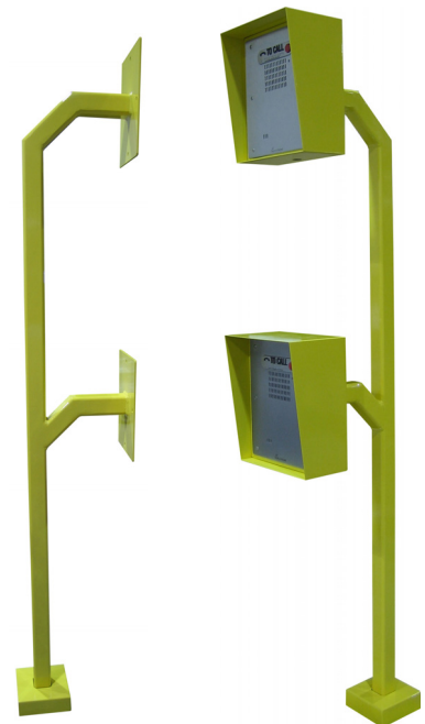
Shown with ETP-SMH

Mounting: Mounts into concrete foundation using anchor bolts