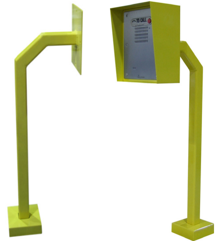
Shown with ETP-SMH