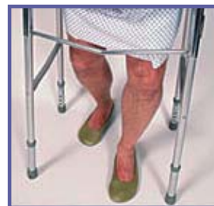
"Walk Out" patients