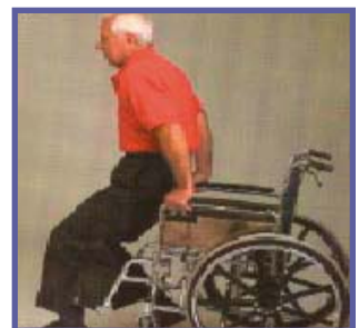
Personnel or Items Leaving Facility