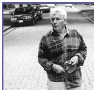
"Missing" or "Lost" patients