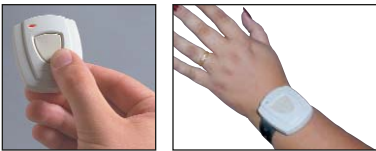
Pendant transmitters come complete with all accessories: Attachment cord, wrist band, necklace, surface mounting and belt clips.

Pendant Transmitters are attached to a cord, on wrist, necklace, beltclip or mounted. A simple press of the button sends the signal to EM-900 to sound alert and display LCD entered information. Pendants are supervised by EM-900 and Automatically send alert and displays whenever Pendant is missing such as a "Walk Out" patient. Man Down Pendant is Automatic and signals when patient is horizontal (Fall). All EM-900 transmitters automatically send signal to alert low transmitter battery .