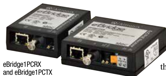
eBridge1PCR and eBridge1PCT