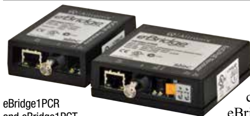
eBridge1PCR and eBridge1PCT