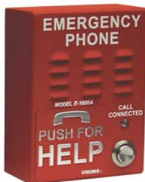
E-1600A Emergency Red

The 1600A Series ADA Compliant Emergency Phones are designed to provide quick and reliable hands-free communication for any standard analog telephone line or analog phone system station port. All 1600A Series phones meet ADA requirements for elevator/emergency telephones, and can be programmed from any Touch Tone phone. The phones can dial up to 5 programmable emergency numbers, as well as 2 central station numbers.