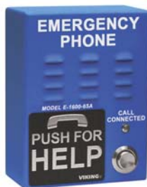
E-1600-65A Emergency Blue