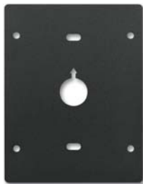
E-1600A-MK-GNP Mounting Plate

The kit includes stainless steel mounting hardware, two gaskets to seal the back of the Emergency Phone and a durable powder coated 12 gauge steel mounting plate.