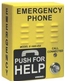
E-1600-45A Safety Yellow