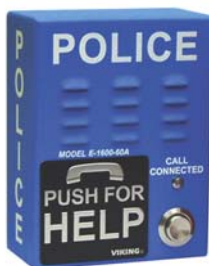
E-1600-60A Police Blue