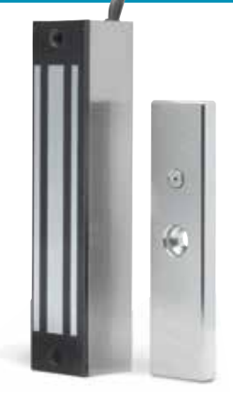
DKGL-S6 600 Lb Maglock and Armature with Welding Mounting Brackets Maglock and Armature