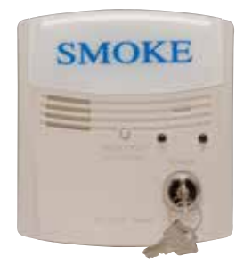
RTS2-AOS UL S2522