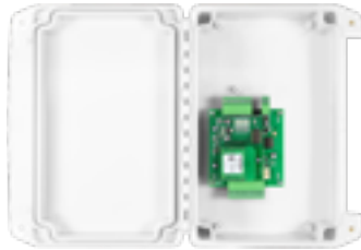
SPX-5631 2.4 GHz