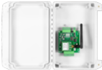
SPX-5641 2.4 GHz