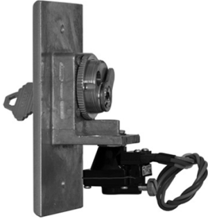
CX-1085 (Mounted to key switch. Sold separately)