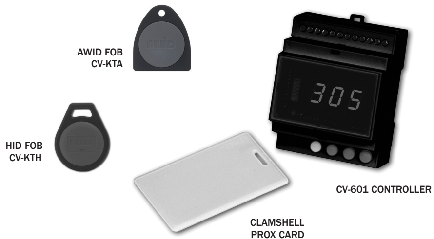
AWID FOB CV-KTA

MPROX consists of two parts: a vandal and weather resistant mullion-mount proximity reader, and a small programmer/controller, which is installed on the secure side inside the facility. The system has a capacity of 999 users. Cards/fobs can be individually or batch enrolled/deleted. All programming is done through the controller and reader - there is no need for computers or software to enroll or delete cardholders.