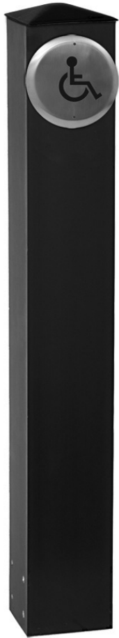
CM-42 BSU-BRZ (Shown with CM-60/2 push plate, sold separately)