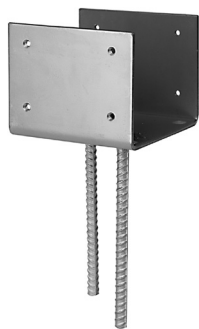
CM-42IG (OPTIONAL) In-ground mounting base