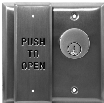
CM-2510/3 (Mortise cylinder sold separately)