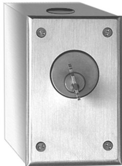
CM-1000 Shown with mortise cylinder (sold separately)