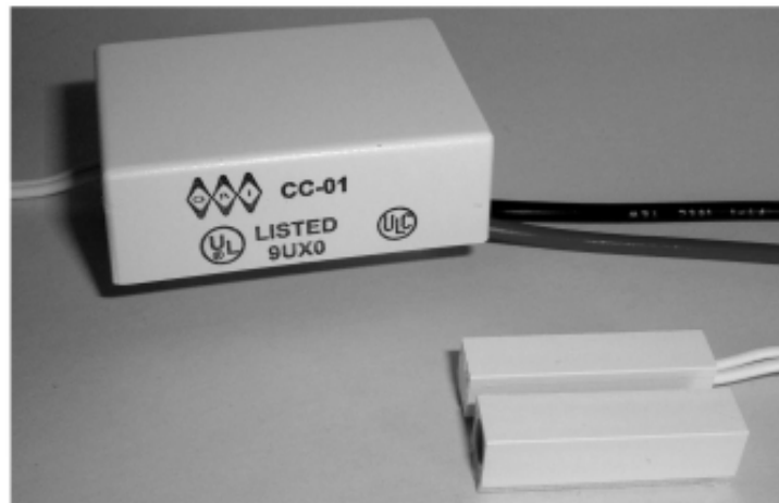
CC-01 1.85" x 1.25"

The GRI Current Controller is an encapsulated circuit with connecting wires to AC power, a light fixture and door monitor switch. A microprocessor circuit is safely isolated from the 120 volts AC. This control signal through the door switch will control the AC power to the light fixture. The GRI Current Controller is designed to fit into an electrical junction box along with the connecting wires.