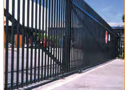
large gates up to 8000 lb